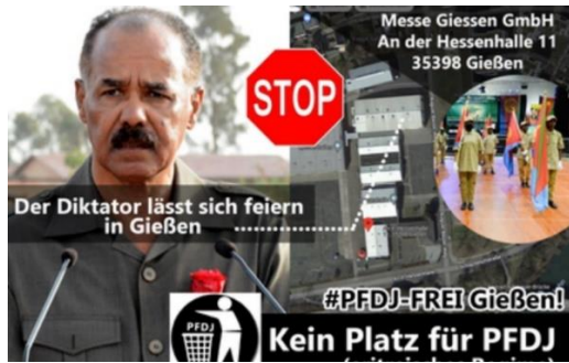
Campaigners leaflet calling "no space for PFDJ"

PFDJ planned to hold a festival in Giessen on 20 August 2022 at the Hessenhallen. Anti-festival activities mounted a powerful, campaign including petitions, to get the authorities to cancel the event but were unsuccessful. 13