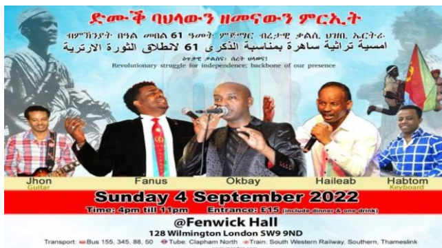
PFDJ ad of the 4 th September event

The second London PFDJ festivals was scheduled to take place on 4 September 2022 at Fenwick Hall, 128 Wilmington, London SW9 9ND, which is a Lambeth Council owned property. The festival was billed to celebrate the 61 st anniversary of the start of the Eritrean armed struggle against Ethiopian oppression.