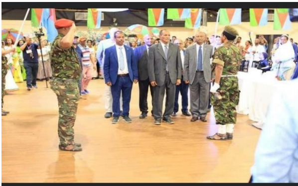
Eritrean “Army Officers” salute government officials in London

London and MPs the event took place as planned. The event as showed through various images by the organisers themselves was in fact a “paramilitary” event with “troops” in Eritrean army uniform and beret leading hate chants against Eritrean opposition groups and Tigrayans in front of minors.