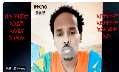
Threat to protestors that their families will be murdered