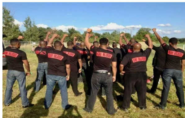
YPFDJ – Isaias's Youth [brainwashed extremists]