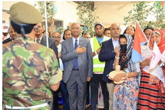
Eritrean “Army Officer” salutes government officials in London