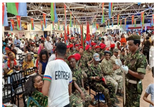
Eritrean “paramilitary” in London amongst women and children.

The photos above, published by the organisers, demonstrate the festival was not a “cultural” event as they claim but an Eritrean “military show” in a foreign land, the legality of which is questionable. These photos and others will be handed over to the relevant UK authorities to take appropriate action. They will also be shared with local authorities across the UK to create an awareness of what these festivals are about.