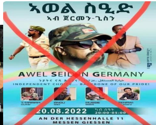
First PFDJ German festival halted by police following violence

Eritrean diaspora and their friends took the issue to court, to try to get the festival cancelled, claiming the purpose of the festival was to spread "hate speech" against Eritrean activists and Tigrayans. But the court ruled in favour of PFDJ and the festivals were allowed to go ahead. The ruling enraged the anti-festival activists and a large crowd gathered outside the festival venue outnumbering the police, scuffle broke out with several people hurt and some detained. Police support from across the region was called in, but they were unable to contain the clashes. Eventually they had to instruct PFDJ to stop the festivals which they did 14 .