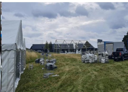
PFDJ's backyard mini festival in Sweden

Following the cancellation of the halls rental contract, PFDJ organised a replacement event which was held in tents in a park at significant cost and hugely reduced revenue flow for the regime.