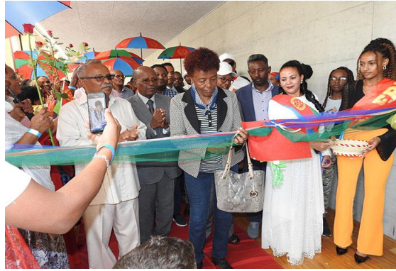
The Governor of the Northern Red Sea Region opening the Sion festival