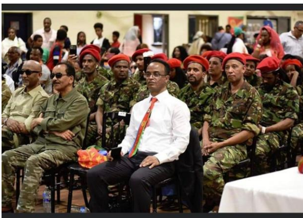
Eritrean officials surrounded by “paramilitary” in London