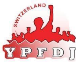
Young PFDJ Switzerland log 21