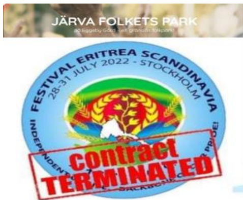
Stockholm festivals cancelled

The PFDJ festival plan in Stockholm faced fierce opposition from the diaspora and their friends with thousands of people taking to the streets demanding for it to be cancelled 12 . The authorities, fearing violence eventually, cancelled the festival.