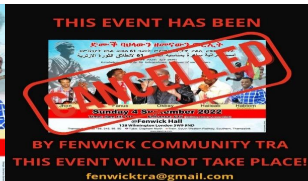
Lambeth Council Event cancellation poster